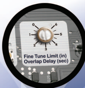
Innovative Fine Tune Adjustment for the end of gate travel (down to 1/8")