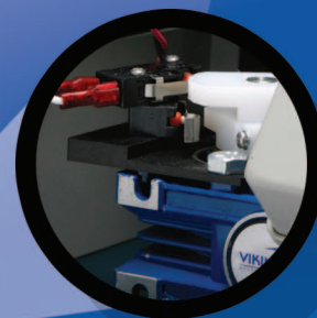
Easy access to limit switch