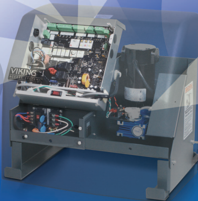
120/220 VAC single phase power source