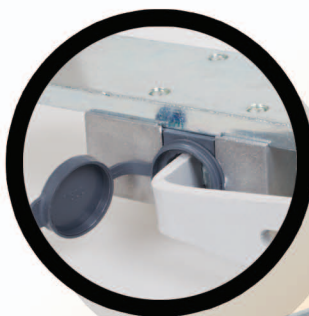
Key for manual release