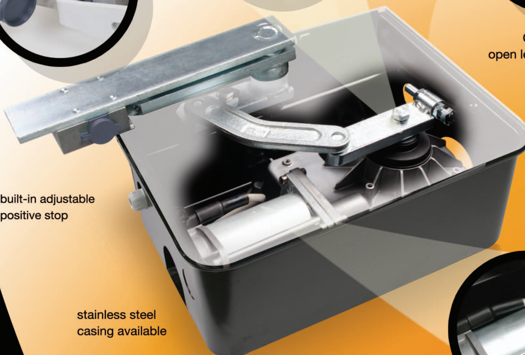
stainless steel casing available