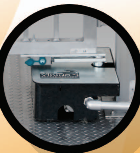
Configurable to open left or open right